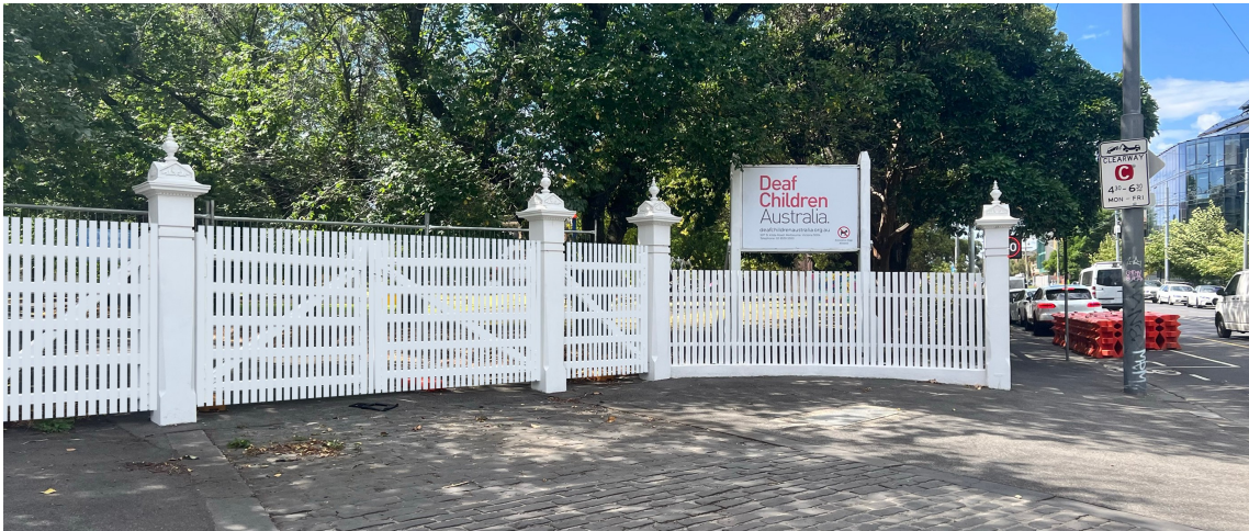
PROPOSED GATE CONDITION