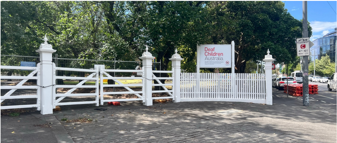
EXISTING FENCE & GATE CONDITION CURRENTLY ONSITE