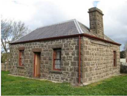
Whitburgh Cottage Mitchell Shire Council Kilmore

A grant of $200,000 has been awarded to Mitchell Shire Council to support the urgent stabilisation and restoration of Whitburgh Cottage. Built in 1853, the cottage is one of the oldest surviving buildings in Kilmore. Due to its current poor condition, the building is closed to the public. The grant will support conservation works to the roof, walls, ceilings, windows, fireplaces, and flooring. These works will enable this historic building to reopen for community use.