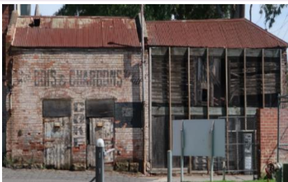
Abbotsford Convent Abbotsford Convent Foundation Abbotsford

A grant of $196,000 has been awarded to the Abbotsford Convent Foundation to undertake urgent structural stabilisation of the Abbotsford Convent Gatehouse ensemble. Located within the Convent site since the 1870s, the ensemble includes the Gatehouse, Stables and Workshop. The Gatehouse ensemble is currently closed due to safety issues. Works include floor, roof, joinery and brickwork repairs, as well as decontamination. The grant will allow the building to become safe and is the first step in making it accessible to the community.