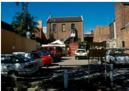
La Mama Theatre La Mama Theatre Carlton

A grant of $100,000 has been awarded to Queen Victoria Women's Centre Trust to support urgent conservation works to the Former Queen Victoria Hospital Tower. The project will repair the building's stormwater system to address water ingress. Built in 1910, the red brick Edwardian building was used as a hospital for most of the century. Today, the place operates as the Queen Victoria Women's Centre, supporting women through information services, events and training. The grant will ensure the ongoing structural integrity and operation of the building.