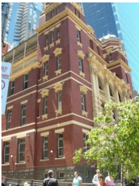
Former Queen Victoria Hospital Tower Queen Victoria Women's Centre Trust Melbourne

A grant of $196,000 has been awarded to the Abbotsford Convent Foundation to undertake urgent structural stabilisation of the Abbotsford Convent Gatehouse ensemble. Located within the Convent site since the 1870s, the ensemble includes the Gatehouse, Stables and Workshop. The Gatehouse ensemble is currently closed due to safety issues. Works include floor, roof, joinery and brickwork repairs, as well as decontamination. The grant will allow the building to become safe and is the first step in making it accessible to the community.