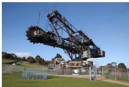
No.21 Dredger Gippsland International Inc Morwell

A grant of $60,000 has been awarded to Gippsland International Inc to support urgent conservation works to the No.21 Dredger. Built in the 1950s, the dredger serviced the Morwell open cut mine for over 40 years. It is one of the first bucket-wheel excavators used on site to remove the overburden waste. The grant will enable the removal or corrosion and repainting of the dredger to ensure its ongoing structural integrity. These works will support increased up-close access to the dredger on open days.