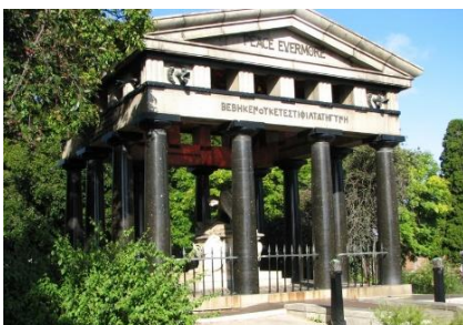
Springthorpe Memorial, Boroondara Cemetery Boroondara General Cemetery Trust Kew

A grant of $200,000 will assist La Mama Theatre to restore after a devastating fire. Built as a printing works in 1883, it has served as a theatre since 1967. The theatre is important for its significant role in the development of Australian drama and has nurtured a host of internationally award-winning Australian playwrights, directors and actors. The grant will enable replacement of the slate roof, repair and reconstruction of brickwork and windows, and reinstatement of original stairs, theatre floorboards and fireplace.