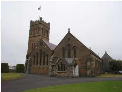
Christ Church Complex Warrnambool City Council Warrnambool

A matched grant of $120,000 has been awarded to Christ Church Warrnambool (Anglican Parish) on a matched-funds basis to undertake urgent conservation works. Built in 1855, the Gothic Revival Church is constructed of sandstone with a slate roof. Today, the Church is open daily to the public and hosts local cultural activities such as concerts and community gatherings. The necessary works to the interior of the Church will repair salt damage and address threats to the interior decoration and architectural values.