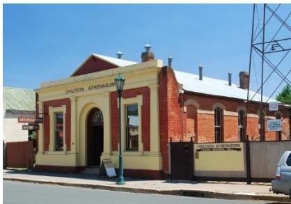
Chiltern Athenaeum and Museum Indigo Shire Council Chiltern

A grant of $120,000 has been awarded to Indigo Shire Council for urgent conservation works to the Chiltern Athenaeum and Museum. The Conservative Classical style building was built in 1866 and still retains much of its original furniture. The Chiltern Athenaeum and Museum is open 7 days a week as a museum and community hub. The grant will enable roof and masonry repairs and works to address water ingress. These works will ensure the longevity of the building and protect its interior objects.