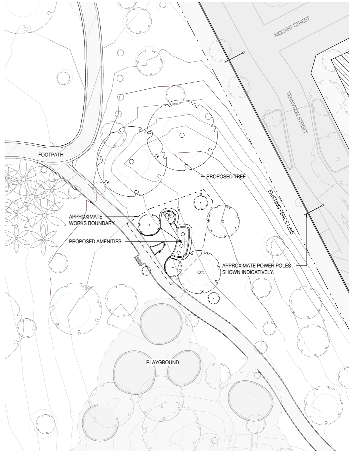
2 PROPOSED SITE PLAN PLAN 1:500