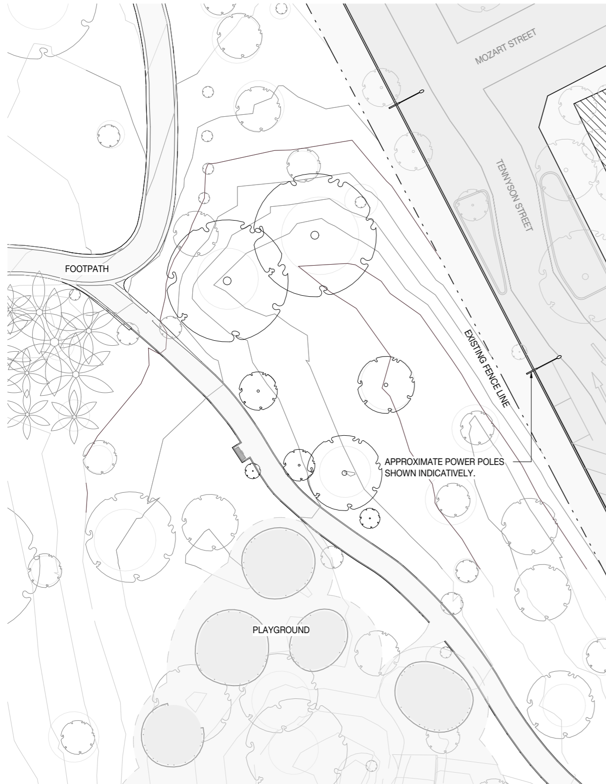
1 EXISTING SITE PLAN PLAN 1:500