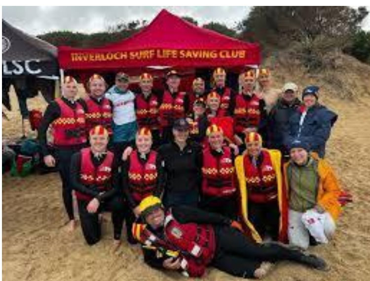
Photo: Inverloch Surf Life Saving Club members

This program enables Heritage Victoria to receive timely information and provide a more rapid response to human interference at wreck sites. It also provides ongoing monitoring of wrecks which cannot be regularly monitored by Heritage Victoria maritime archaeologists.