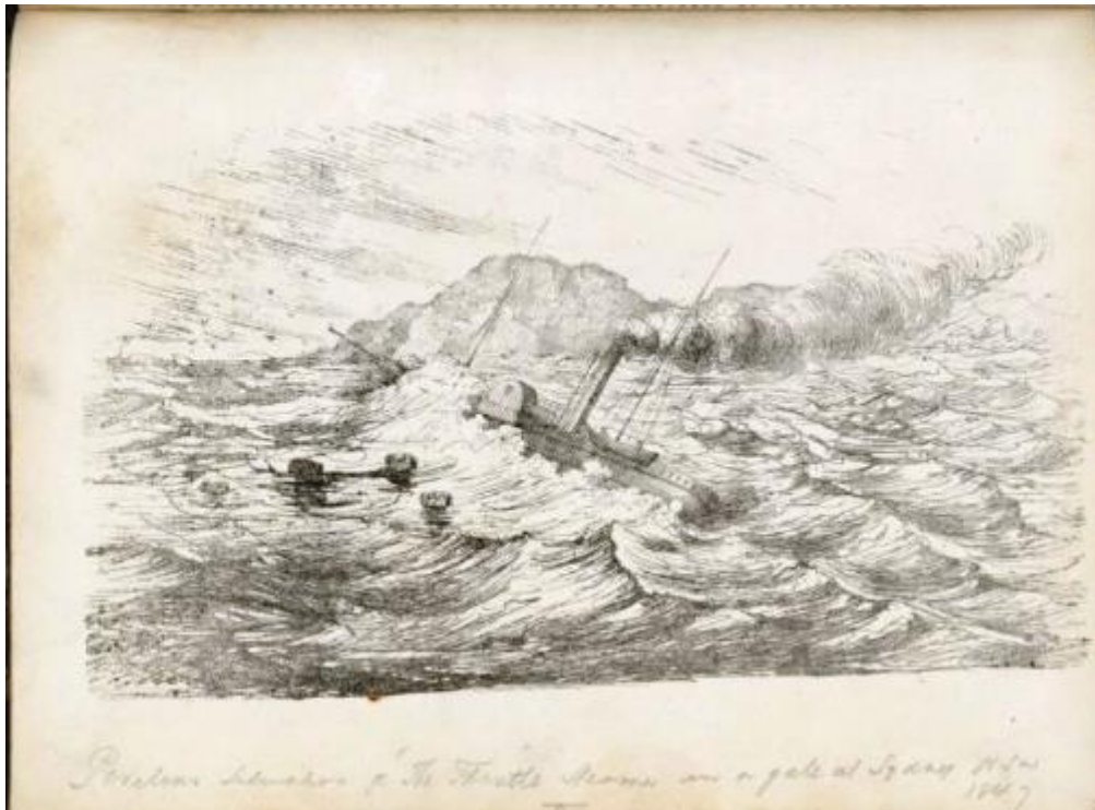
Baker. W "Perilous situation of "The Thistle" steamer in a gale at Sydney, N.S.W 1847".

The program was expanded in 2022/23 to include On Watch* shipwrecks and submerged aircraft wrecks.