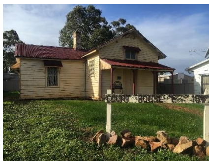
Balmoral Court House Balmoral & District Historical Society Balmoral

A grant of $195,000 has been awarded to Warrnambool City Council to undertake urgent conservation works to the failing timber elements of the Wollaston Bridge. The suspension bridge was erected across the Merri River in 1890 as an entrance to the Wollaston Estate. Today, the bridge is one of the oldest surviving cable suspension bridges in Victoria and a local landmark. The bridge provides a key link for pedestrians over the Merri River and is frequently used for birdwatching, cycling, and other recreational activities.