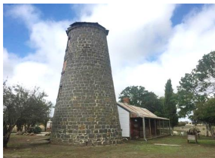
Windmill Farm Kyneton Historical Society Inc. Kyneton

A grant of $20,000 has been awarded on a matched-funds basis for the urgent repair and stabilisation of the Mill roof and column, which is currently at risk of collapsing. The mill site dates from the mid nineteenth century and is the only surviving wind driven flour mill in Victoria. The emergency works is the first step in enabling this historic site to be re-opened to the community for guided tours and community days, and as a venue for public events.