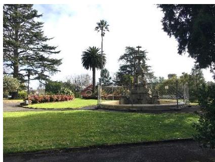
Hamilton Botanic Gardens Thomson Memorial Fountain Friends of Hamilton Botanic Gardens Hamilton

A grant of $195,000 has been awarded on a matched-funds basis to Crossroads Uniting Church in Werribee. The grant will fund urgent roof repairs to the Church and Manse. Both buildings are currently suffering from extensive water ingress due to the failing roofs. Erected in 1884, the church is a key site on the Werribee City Council Heritage Trail. The historic bluestone church has a strong community outreach program, bridging different cultures and backgrounds by providing a centre for community activity. The grant will contribute to the continued use of this important community asset.