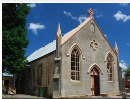
Former Methodist Church (Quercus) Quercus Beechworth Beechworth

A grant of $55,000 has been awarded to Quercus Beechworth to undertake conservation works to the former Methodist Church in Beechworth, repairing extensive water damage within the nave. Built in 1857, it was the first permanent church building on the Ovens goldfields. Today, the building is a much-used community centre, offering a range of activities including community food programs, educational activities and community gardens and provides a government access point. The grant will ensure this historic building continues to serve as a meeting point for the local community.