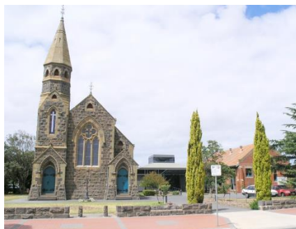
Crossroads Uniting Church Crossroads Uniting Church Werribee

A grant of $195,000 has been awarded on a matched-funds basis to Crossroads Uniting Church in Werribee. The grant will fund urgent roof repairs to the Church and Manse. Both buildings are currently suffering from extensive water ingress due to the failing roofs. Erected in 1884, the church is a key site on the Werribee City Council Heritage Trail. The historic bluestone church has a strong community outreach program, bridging different cultures and backgrounds by providing a centre for community activity. The grant will contribute to the continued use of this important community asset.