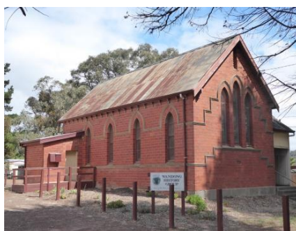
Former St Michael's Catholic Church Wandong History Group Wandong

A grant of $55,000 has been awarded to Quercus Beechworth to undertake conservation works to the former Methodist Church in Beechworth, repairing extensive water damage within the nave. Built in 1857, it was the first permanent church building on the Ovens goldfields. Today, the building is a much-used community centre, offering a range of activities including community food programs, educational activities and community gardens and provides a government access point. The grant will ensure this historic building continues to serve as a meeting point for the local community.