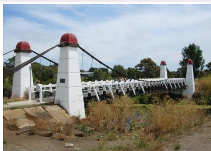
Wollaston Bridge Warrnambool City Council Warrnambool

A grant of $195,000 has been awarded to Warrnambool City Council to undertake urgent conservation works to the failing timber elements of the Wollaston Bridge. The suspension bridge was erected across the Merri River in 1890 as an entrance to the Wollaston Estate. Today, the bridge is one of the oldest surviving cable suspension bridges in Victoria and a local landmark. The bridge provides a key link for pedestrians over the Merri River and is frequently used for birdwatching, cycling, and other recreational activities.