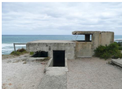
Point Lonsdale Lighthouse Searchlight Emplacement Borough of Queenscliffe Point Lonsdale