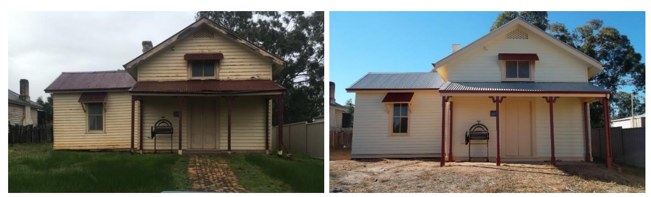
Balmoral Court House, before works