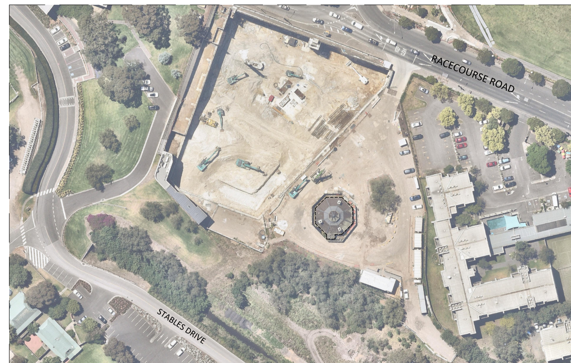
03 JOCKEYS' CONVALESCENT LODGE - SITE PLAN 1:1000