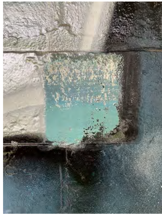
Figure 5: Acetone test area, after graffiti removal