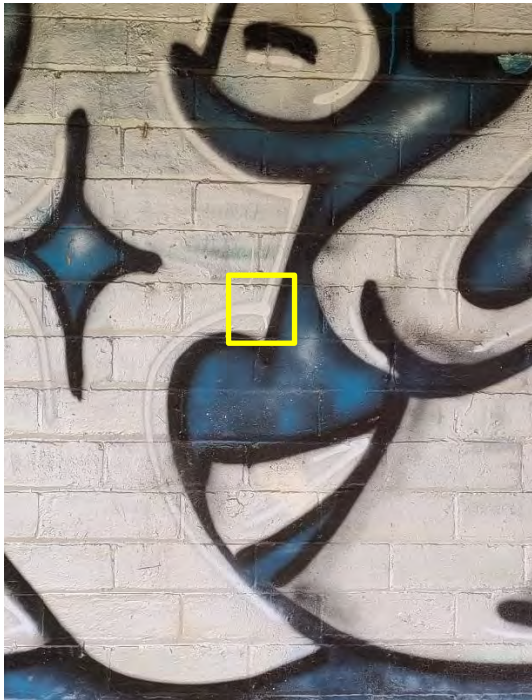
Figure 4: Acetone test area outlined in yellow, before graffiti removal