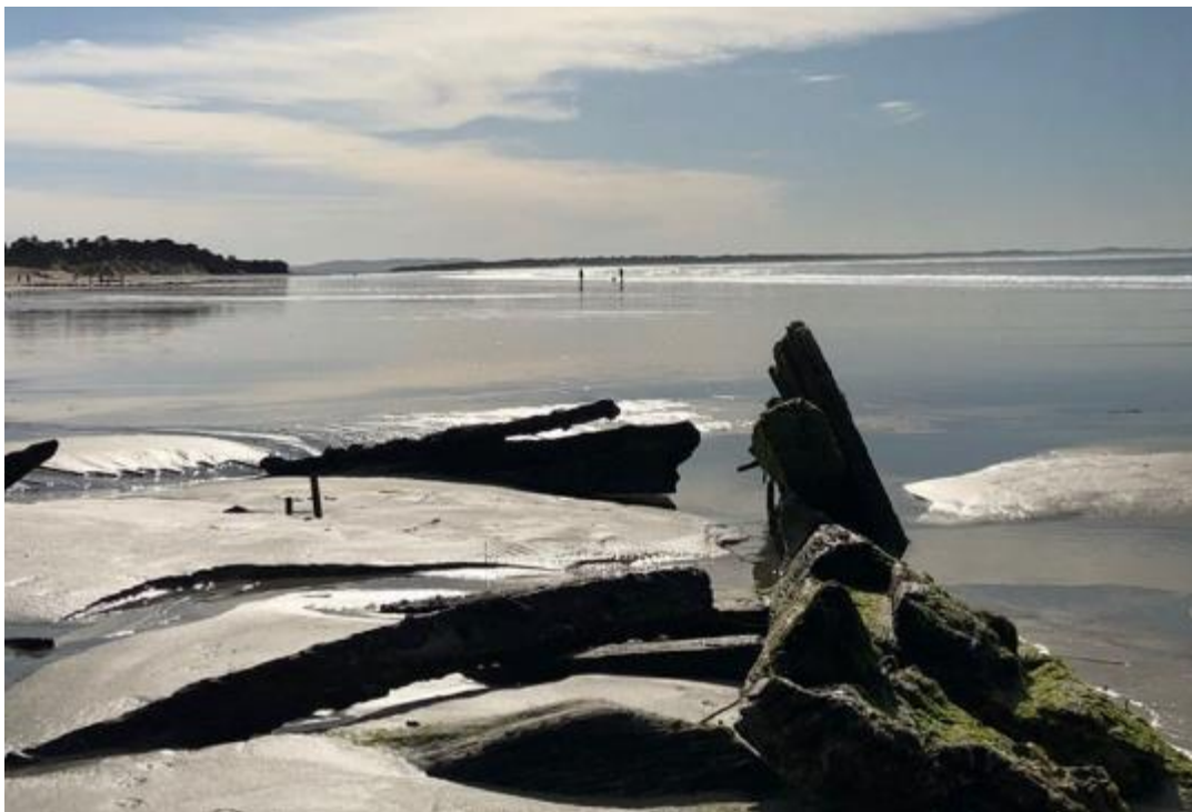
Photo: Amazon wreck; Warren Cook, Inverloch Surf Life Saving Club.

The 2020/21 Annual Report includes information on conservation, monitoring and inspections conducted at wreck sites. Due to COVID-19 restrictions several activities were severely curtailed during the year.