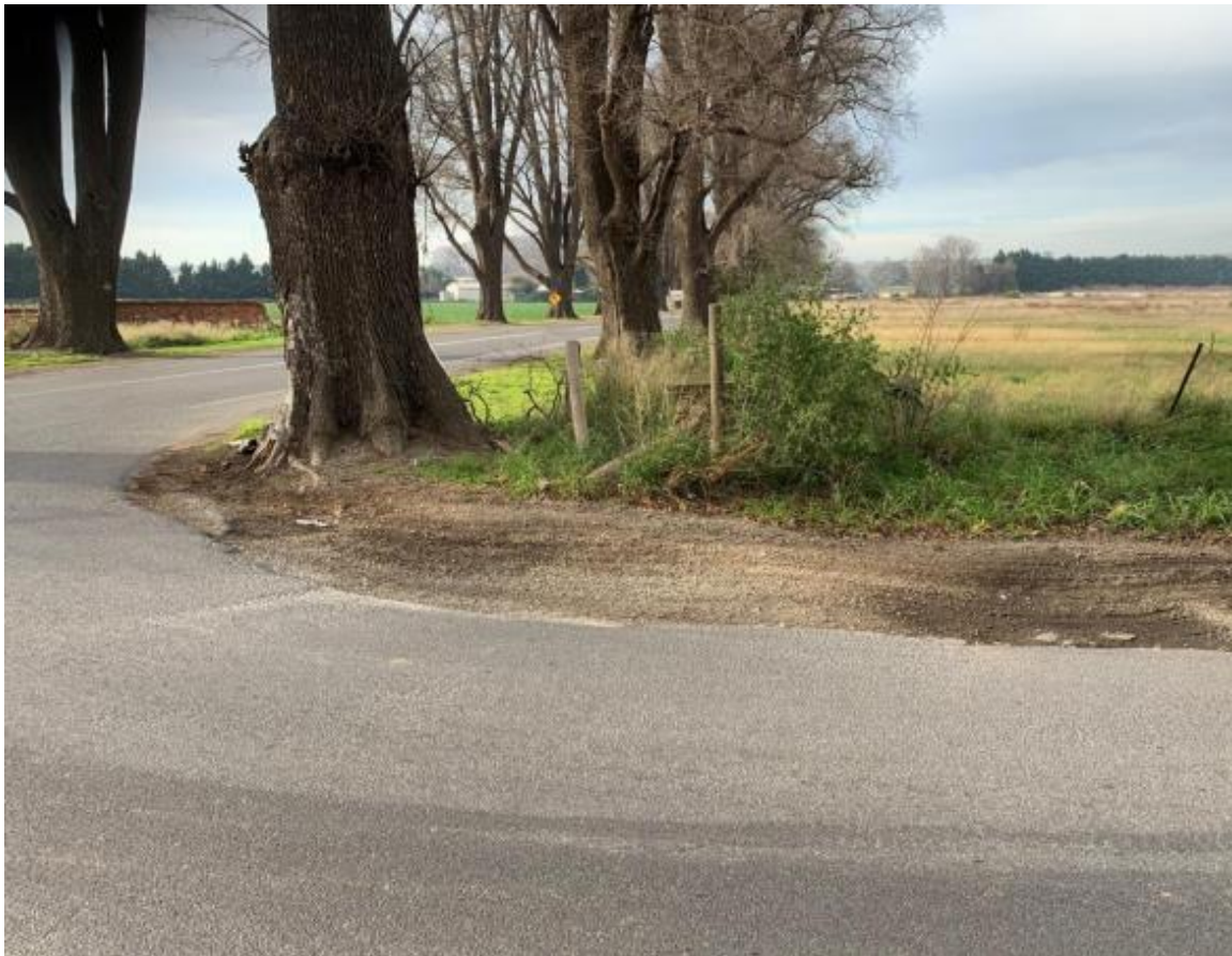
Figure 1: Degraded road shoulder at the intersection of Bacchus Marsh Road and Woolpack Road.

Heritage Victoria has issued a permit exemption for minor road works at the south-east corner of the intersection of Bacchus Marsh Road and Woolpack Road. The road shoulder in this area is degraded (see Figure 1) and the road repairs will ease potential root compaction of the Dutch Elm tree planted at the intersection. The tree was planted in dedication to Lieutenant Corporal W.G. Medling. The road works include rehabilitation of the road shoulder and pavement widening to protect the tree.