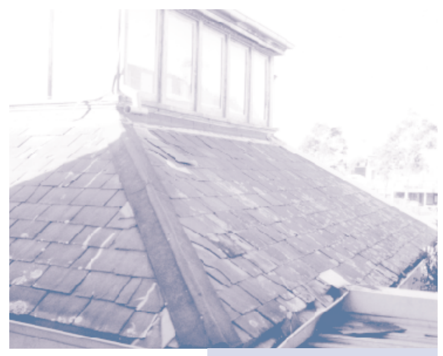
Slipping slates in the worst possible location: directly below a rainwater spreader.

Where the roof structures are old and crooked but otherwise sound, they should not be renewed or straightened beyond what is essential for safety and watertightness. Much of the character of an old roof derives from its irregularities, and these will be lost if the roof is made too symmetrical and straight.