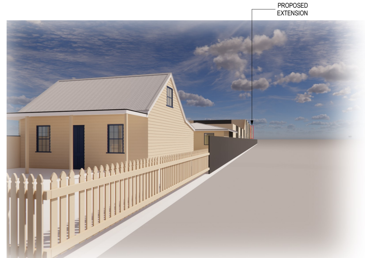
CAMERA NO 2