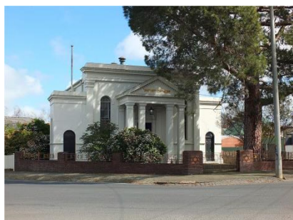
Ballarat Synagogue Ballarat Hebrew Congregation Inc Ballarat

A grant of $80,000 has been awarded to the Northern Grampians Shire Council for urgent conservation works to the north and south ticket booth buildings at Central Park in Stawell. This will enable the use of these assets as originally intended – such as for the famous Stawell Gift - and reduce the risk of recent targeting by vandals. The ticket booths date from the first half of the twentieth century, but the reserve has been used for sporting events since the 1860s.