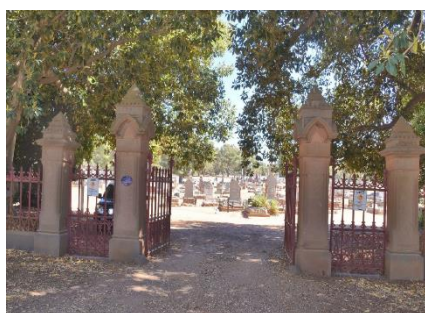
White Hills Cemetery Bendigo Cemeteries Trust t/a Remembrance Parks - Central Victoria White Hills

A matched grant of $200,000 has been awarded to St Andrews Uniting Church for conservation works to restore the gothic revival church, designed by a local Echuca architect and engineer in 1901. The works will address the deteriorating condition of spaces in the Church used by the parish and community for community outreach. The repairs will enable the continued use of the Church's facilities for the local community.