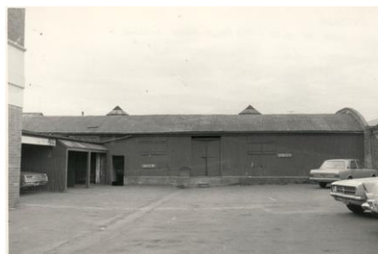
Porter Prefabricated Iron Store The Sovereign Hill Museums Association Golden Point

A grant of $54,000 has been awarded to the Old Curiosity Shop in Ballarat to undertake urgent conservation works to the front wall at the Old Curiosity Shop in Ballarat. The wall is inlaid with a myriad of eclectic objects, creating a mosaic which has long intrigued passers-by. Construction on the house began in 1855 and in 1895 it opened to the public as a local tourist attraction. The grant will protect the wall from complete collapse, ensuring it is stabilised, mitigate public health and safety risks and prevent the loss of this historic item.