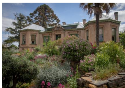
Buda Buda Historic Home and Garden Inc Castlemaine

A grant of $200,000 has been awarded to the City of Bendigo for repairs to the Purifier Shed at the former Bendigo Gas Works. The Gas Works was built in 1860 to produce coal gas and operated until 1973 and the introduction of natural gas. The conservation works will repair the Purifier Shed - one of the historic buildings on site. Council will also undertake contamination remediation with the eventual goal of enabling public access to this important industrial historic place.