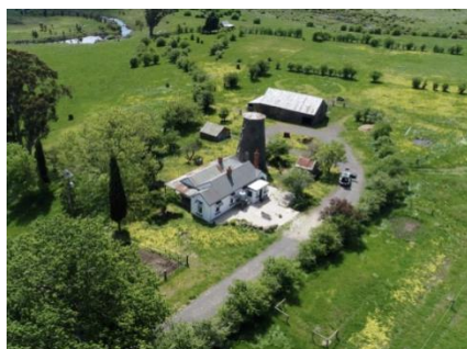
Windmill Farm Kyneton Historical Society Inc. Kyneton

A grant of $120,000 has been awarded to the Buda Historic Home and Garden Inc. organisation to undertake urgent repairs to the building to restore at risk fabric and ensure continuation of public access. This 1863 grand villa in Castlemaine is managed by the Foundation to conserve the house and garden for public use. The repairs will enable continued use and access to the community, tourists, volunteer groups and general public for tours, events and workshops.