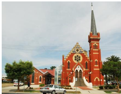
St Andrew's Uniting Church The Uniting Church of Australia Property Trust (Victoria) Echuca

A matched grant of $200,000 has been awarded to St Andrews Uniting Church for conservation works to restore the gothic revival church, designed by a local Echuca architect and engineer in 1901. The works will address the deteriorating condition of spaces in the Church used by the parish and community for community outreach. The repairs will enable the continued use of the Church's facilities for the local community.