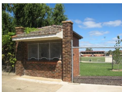
Central Park (Ticket Booths) Northern Grampians Shire Council Stawell

A matched grant of $47,000 has been awarded to St Peter's Lutheran Church for conservation works to return the Hill Pipe Organ, located in St Peter's, Stawell to full working order. The Pipe Organ was built to order in 1858 by the William Hill organ building firm. It is a very rare organ, if not unique in many aspects. The organ is in poor condition and the conservation works aim to restore it to operation for the congregation and music enthusiasts alike.