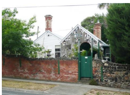
Old Curiosity Shop Private Owner Ballarat

A matched grant of $107,000 has been awarded to the Ballarat Hebrew Congregation for conservation works to the 1861 Ballarat Synagogue. Designed by a local Ballarat architect, the Synagogue has one of the few surviving 19 th century synagogues in Victoria. As well as providing a place of worship, the Synagogue is visited by schools and community groups year-round. The works will ensure the building is structurally stable and water tight, and ensure its ongoing use by the community.