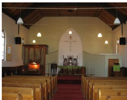
Hill Pipe Organ - St Peter's Lutheran Church, Stawell St Peter's Lutheran Church Stawell Stawell

A matched grant of $47,000 has been awarded to St Peter's Lutheran Church for conservation works to return the Hill Pipe Organ, located in St Peter's, Stawell to full working order. The Pipe Organ was built to order in 1858 by the William Hill organ building firm. It is a very rare organ, if not unique in many aspects. The organ is in poor condition and the conservation works aim to restore it to operation for the congregation and music enthusiasts alike.