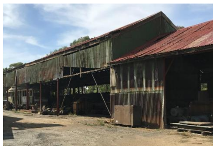
Former Bendigo Gas Works City of Greater Bendigo Bendigo

A grant of $200,000 has been awarded to the Bendigo Cemeteries Trust for urgent conservation works to stabilise and repair the cast iron and bluestone entrance gates and fence of the White Hills Cemetery. The gates date from 1854 and serve as the entrance to the Chinese section of the historic cemetery which contains over 1000 burials. The gates are structurally unsound and require restoration works to return them to working order. The works will stabilise the gates, enabling cemetery visitors and tourist's safe entry.