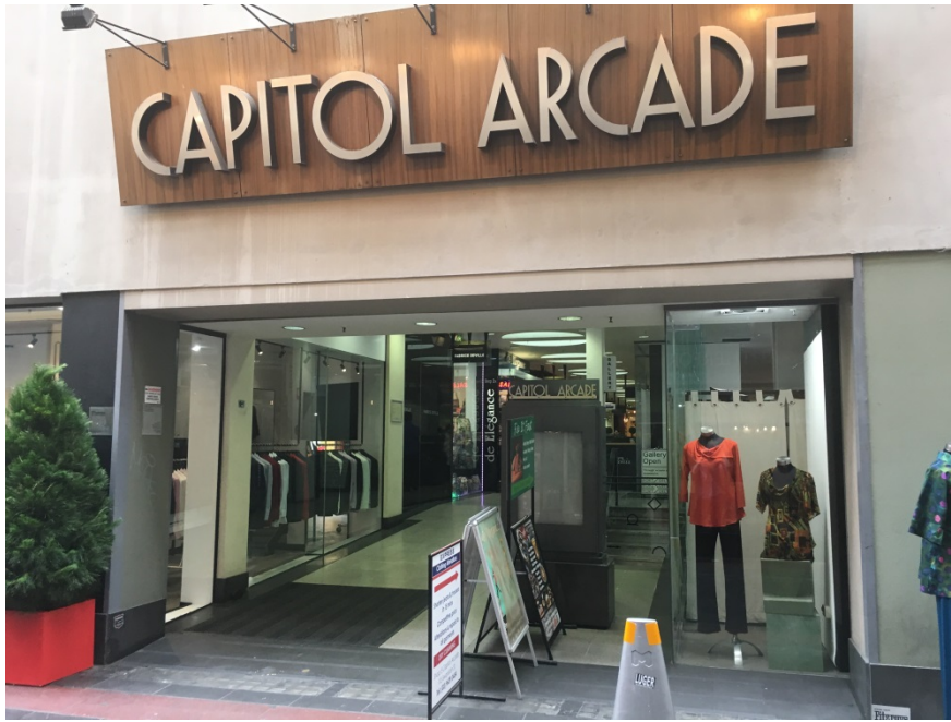
Figure 6, Capitol House, arcade entry from Howie Place, 2017