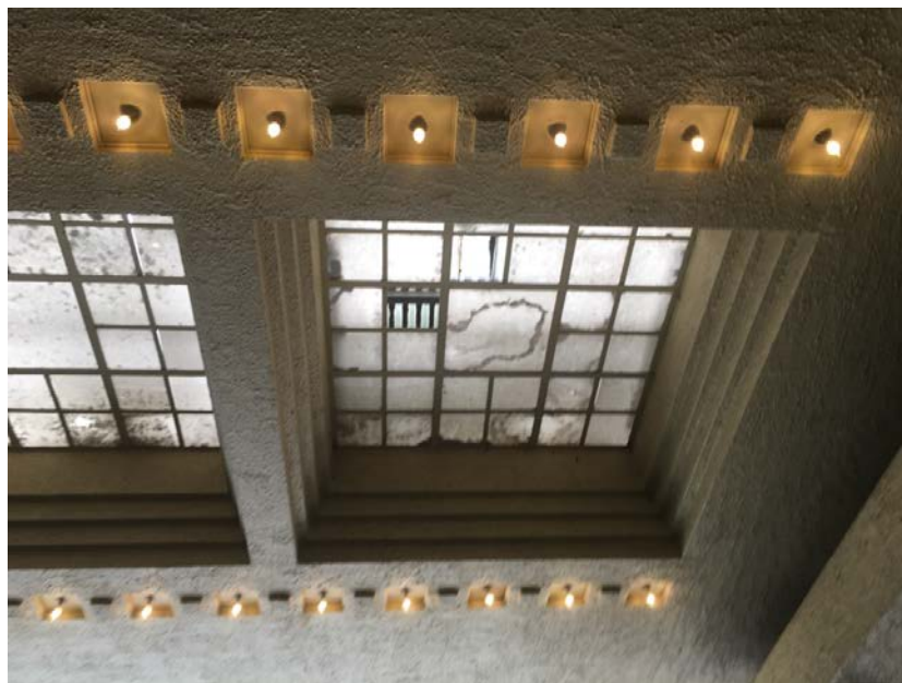
Figure 5, Capitol House, detailed view of awning soffit and roof light showing general condition, 2017.