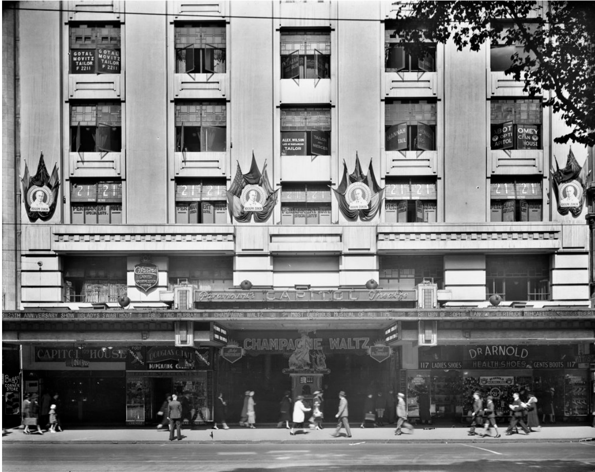
Figure 1. Capitol House, Photograph, c. 1937

Michael Taylor Architecture and Heritage Level 6, 443 Little Collins Street Melbourne Vic 3000