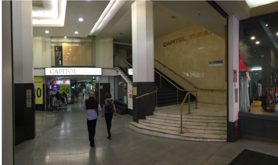
Figure 7, Capitol Theatre, existing foyer and stairs 2017

Restoration works to awning shall include cleaning, replacement of missing and damaged glazed “lights”, re-lamping, painting, renewal of suspended signage brackets.