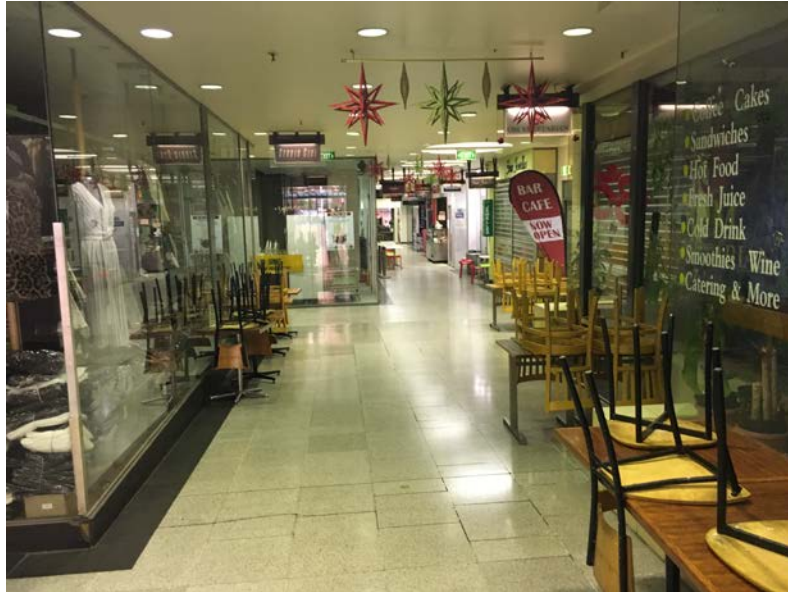
Figure 4, Capitol Arcade, view from foyer, 2017