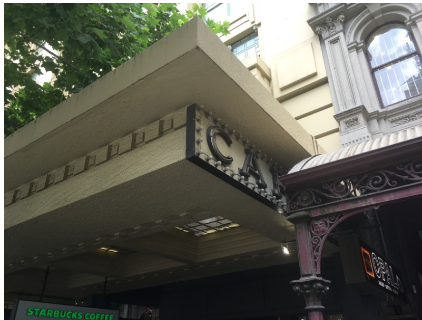
Figure 3, Capitol House, illuminated sign on north end of the awning, 2017

The Swanston Street awning is in fair condition and appears to be reasonably intact to the original design. It was restored around 1995 when the 1960s claddings and soffits were removed. The awning has a number of metal signage brackets underneath. The provenance of these brackets isn't known. An illuminated sign on the north fascia is sadly hemmed in the northern neighbour's reproduction verandah.