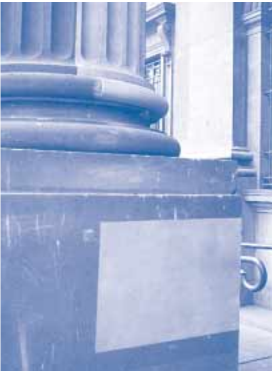
This small test area on the portico of the State Library of Victoria illustrates the extent of soiling of the stone.