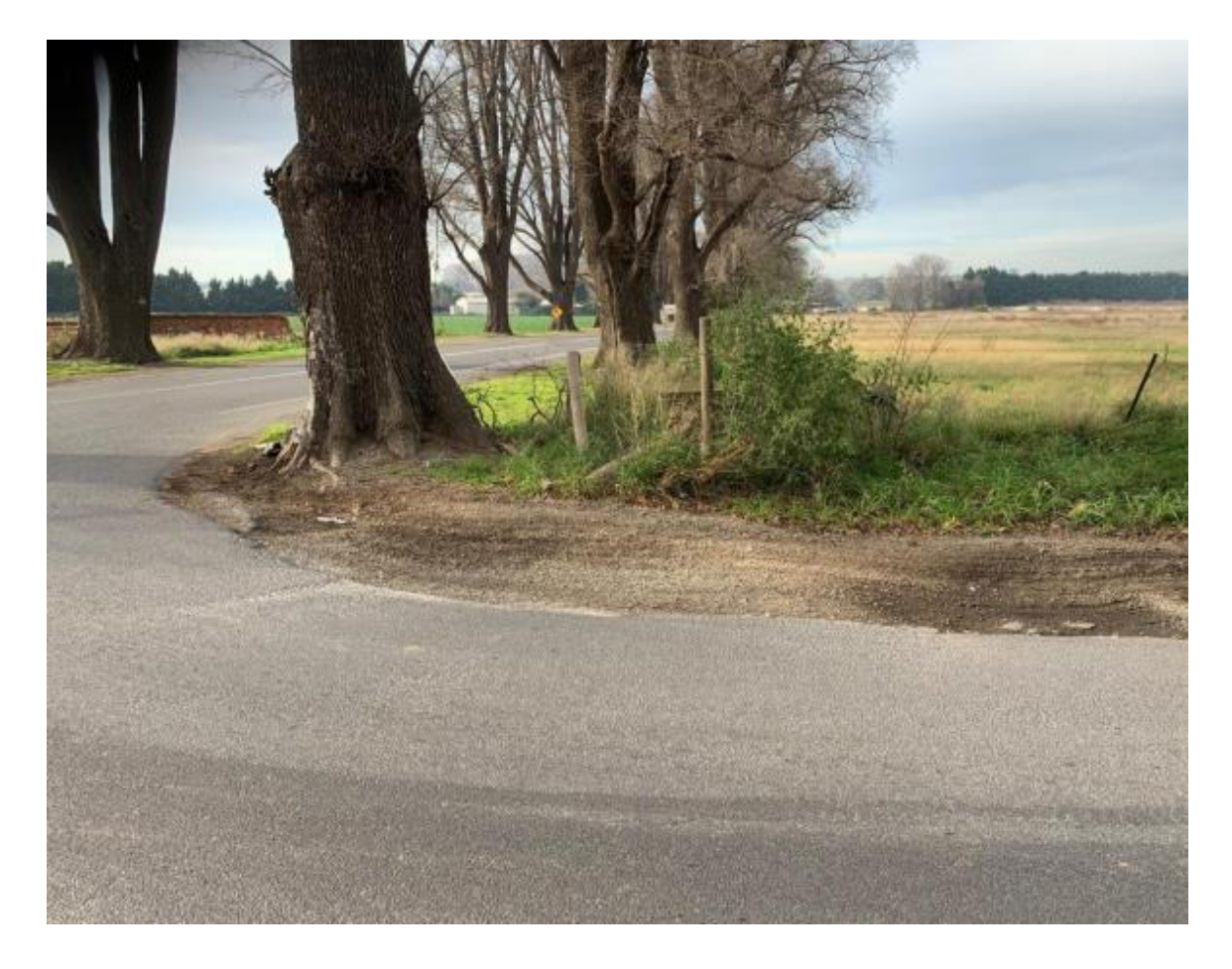
Figure 1: Degraded road shoulder at the intersection of Bacchus Marsh Road and Woolpack Road.

Heritage Victoria has issued a permit exemption for minor road works at the south-east corner of the intersection of Bacchus Marsh Road and Woolpack Road. The road shoulder in this area is degraded (see Figure 1) and the road repairs will ease potential root compaction of the Dutch Elm tree planted at the intersection. The tree was planted in dedication to Lieutenant Corporal W.G. Medling. The road works include rehabilitation of the road shoulder and pavement widening to protect the tree.