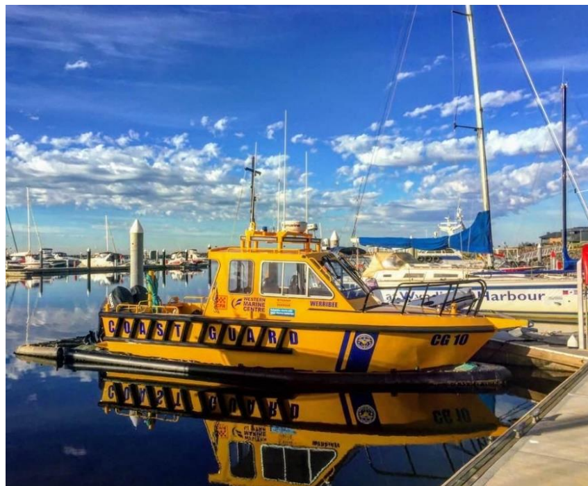
Photo: Werribee Volunteer Coast Guard vessel.

The program is provided with funding from the Commonwealth Department of Agriculture, Water and the Environment.